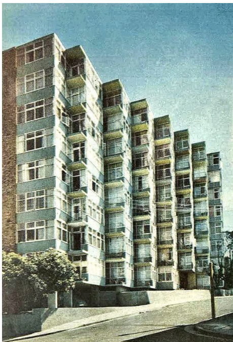
Figure 1 The Seven Seas, Kirribilli, completed 1958.