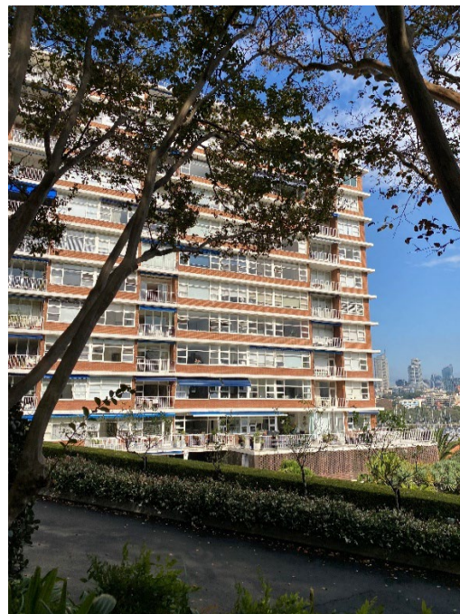
Figure 2 Glenhurst Gardens, Darling Point, completed just one year after The Gateway, was also a notable early project that utilised the lift-slab construction methodology.